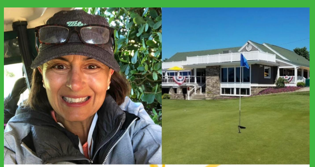
By Members - 50,551 competitive rounds posted by 11,946 golfers